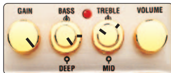
SCREAMING SOLO (Amp: Clean)