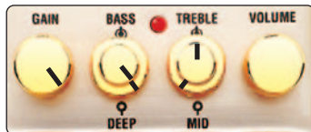
GRUNGE / HARDCORE (Amp: Clean)