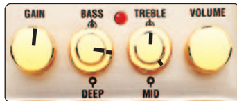
FAT BLUES (Amp: Clean)