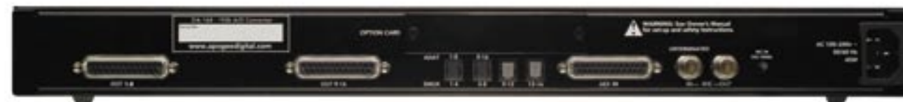
DA-16X REAR PANEL

Due to on-going development Apogee reserves the right to change all information and specifications without notice.