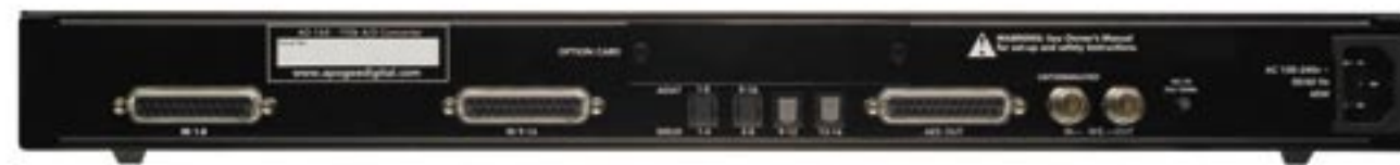
AD-16X REAR PANEL

Featuring X-Series Expansion Cards for direct connectivity with: ProTools | HD and all other popular DAW's via FireWire